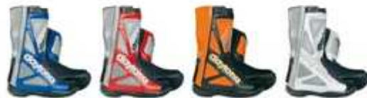
blue-titan red-titan black-orange white-titan