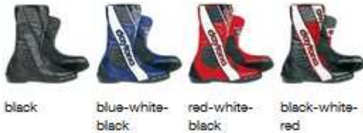
black blue-white-black red-white-black black-white-red