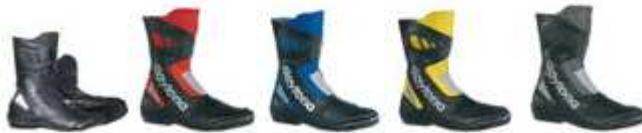
black black-red black-blue black-yellow black-gunmetal